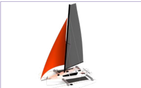
TRICAT 8.50 - TRICAT