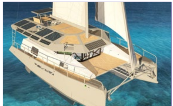
Tortue 147 - CATARUGA