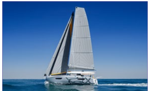
Excess 13 - EXCESS CATAMARANS