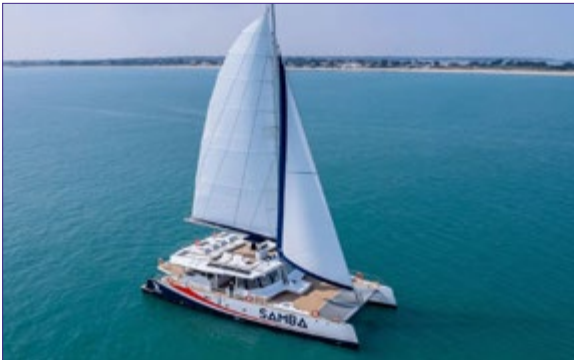
DAY 1 80.09 SAMBA - DAY ONE