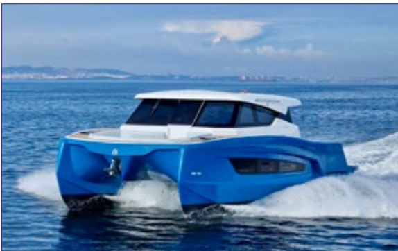
A38SC - AVENTURA YACHTS