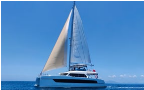
Seaview 59 - HEYSEA YACHTS