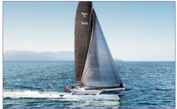
Dragonfly 36 - HELLOMULTI