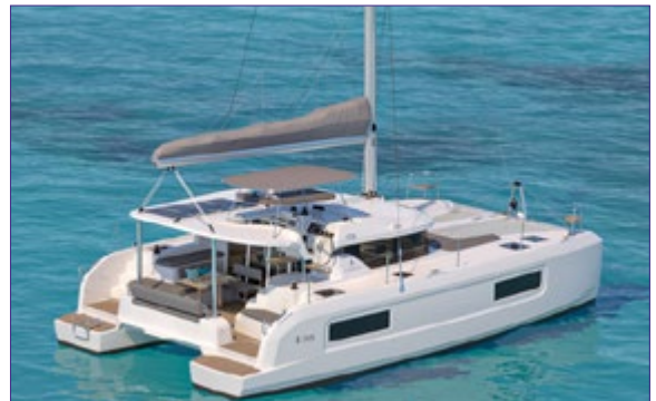
Lagoon 38 - LAGOON CATAMARANS