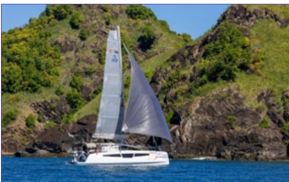
C CAT 38 STD - COMAR YACHTS