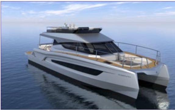
A38MY - AVENTURA YACHTS