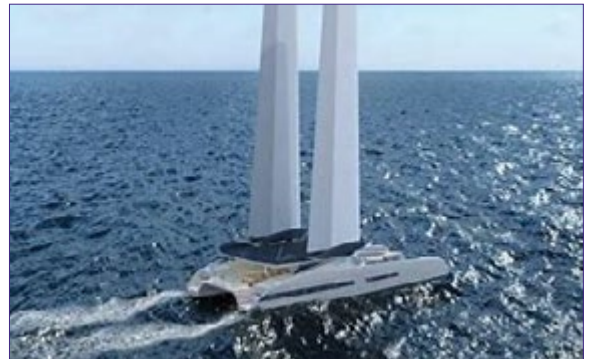
MODX 70 - MODX CATAMARANS