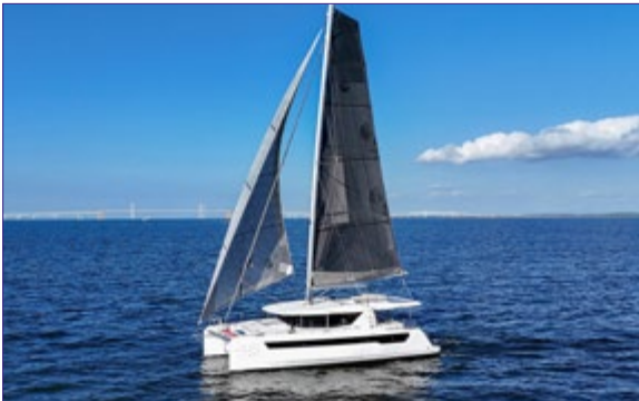
Leopard 46 PC - LEOPARD CATAMARANS