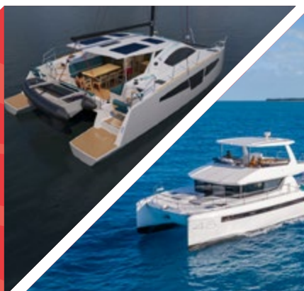
◀ Leopard 46