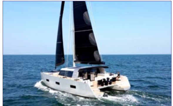
Vaan R5 - VAAN YACHTS