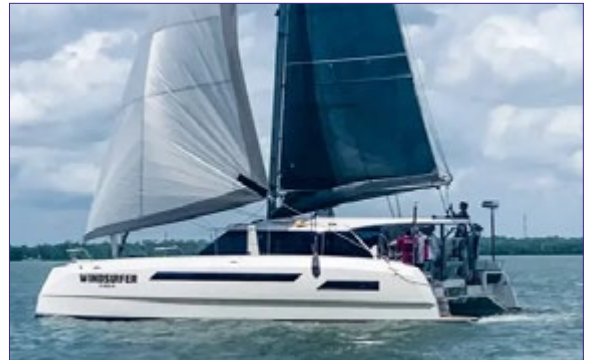
MC 44 SC - MAX CRUISE MARINE